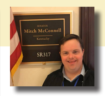
CCDD ANNUAL REPORT 2018